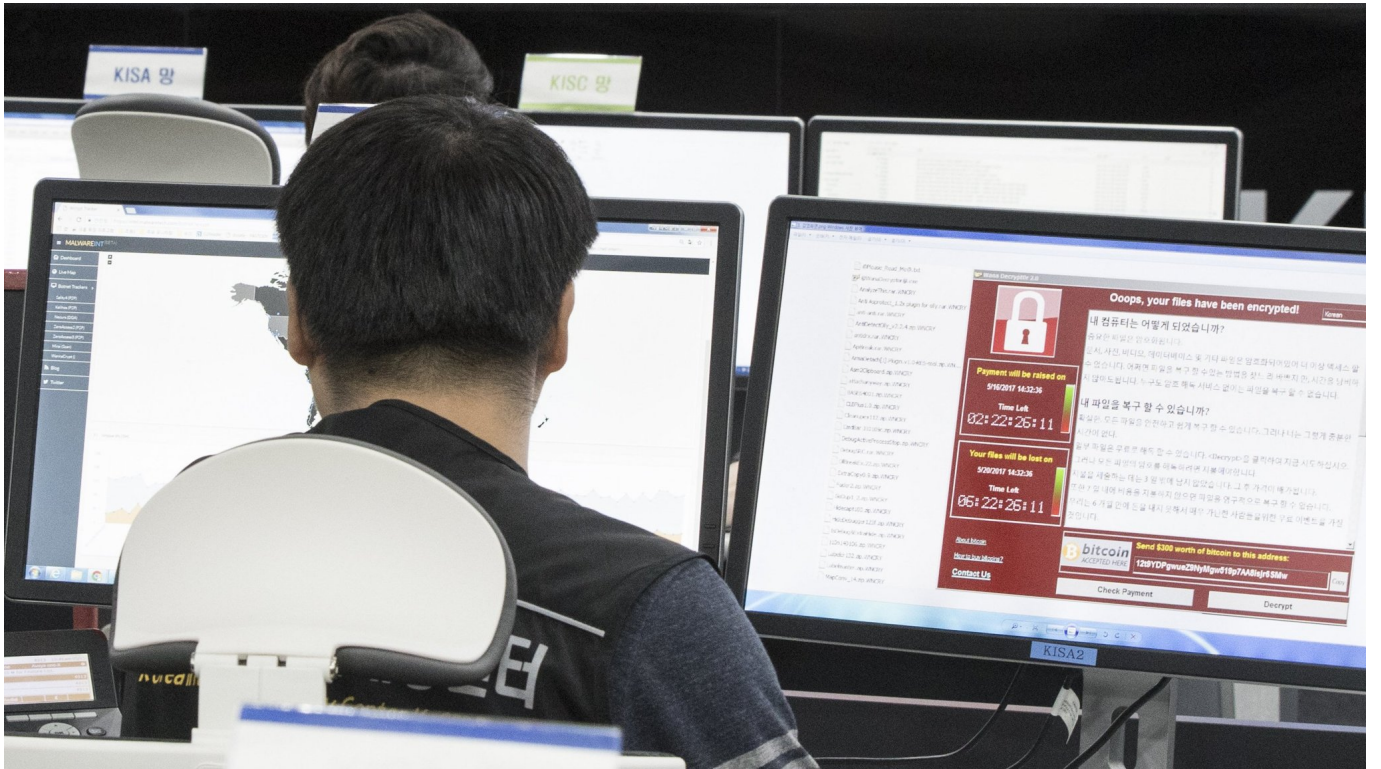
US Intelligence Reveals Malware, Blames North Korea